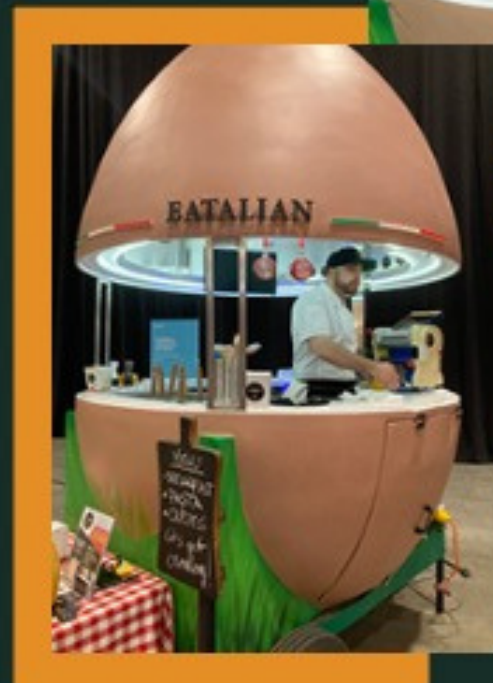
CHOOSE YOUR OWN