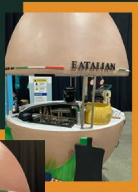
TAKE IT ANYWHERE